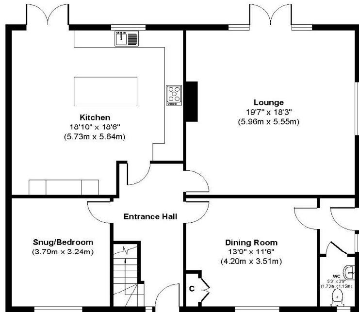
Ground Floor Approximate Floor Area 1169 sq. ft (108.61 sq. m)