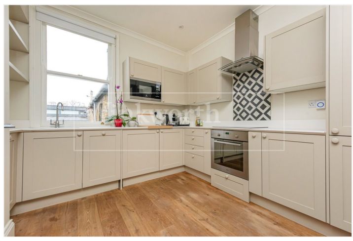
PEMBER ROAD, NW10 £2,700 PER MONTH FURNISHED