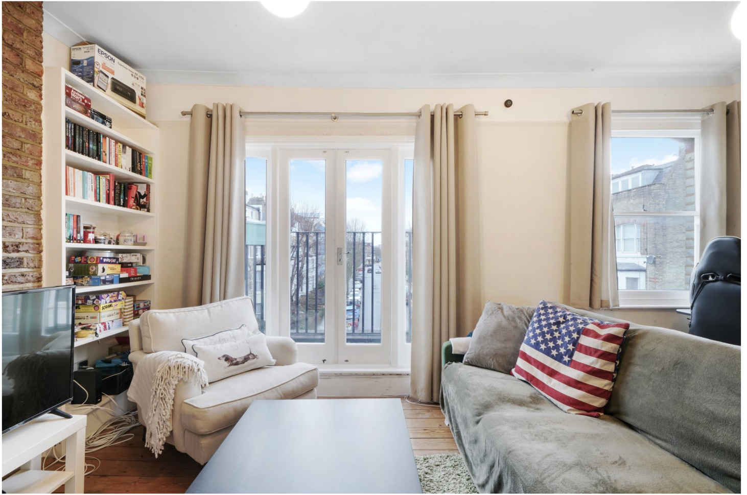
A view to the front