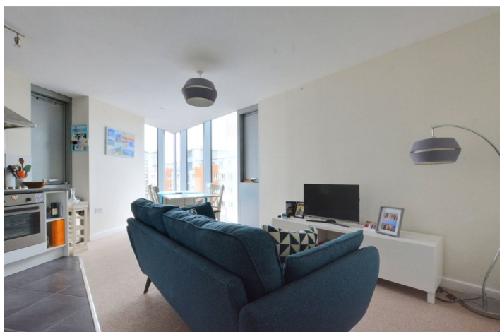
VERTEX TOWER, SE8 £1,850 PER MONTH PART FURNISHED, UNFURNISHED