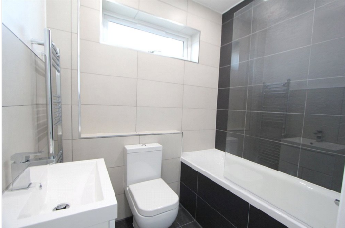
NESS ROAD, SOUTHEND-ON-SEA, ESSEX, SS3 £900 PER MONTH UNFURNISHED