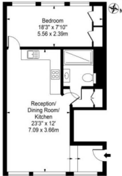
Second Floor For Illustration Purposes Only - Not To Scale

This floor plan should be used as a general outline for guidance only and does not constitute in whole or in part an offer or contract. Any intending purchaser or lessee should satisfy themselves by inspection, searches, enquiries and full survey as to the correctness of each statement. Any areas, measurements or distances quoted are approximate and should not be used to value a property or be the basis of any sale or let.