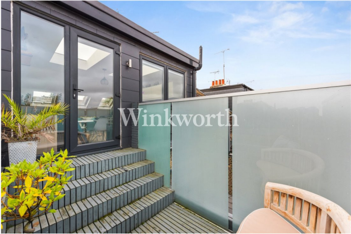
EFFINGHAM ROAD, N8 £675,000 LEASEHOLD