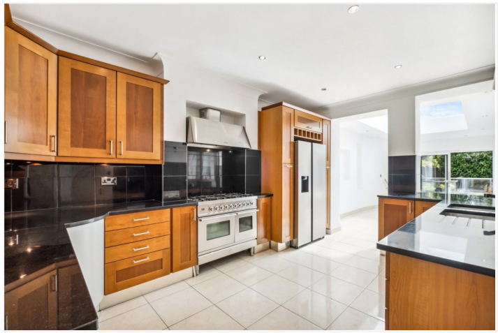
SISPARA GARDENS, SW18 £6,500 PER MONTH UNFURNISHED

Southfields | 020 8877 1000 | southfields@winkworth.co.uk