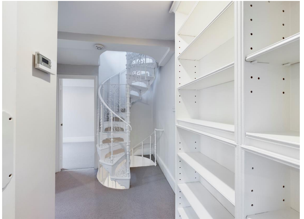
Freehold | Two Double Bedrooms | Dual aspect | Prime Location