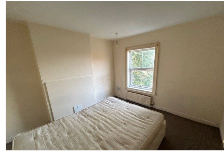
Bedroom Two - 11'5" x 7'9" (3.48m x 2.36m)