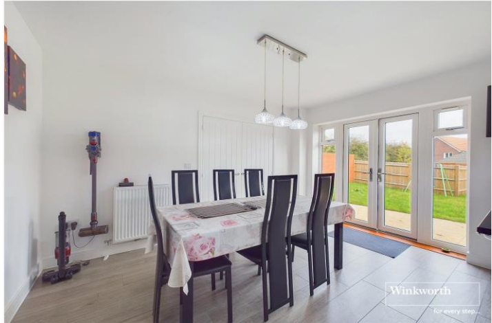
MAYFLOWER MEADOW, READING, BERKSHIRE, RG7 1YD GUIDE PRICE £800,000 FREEHOLD