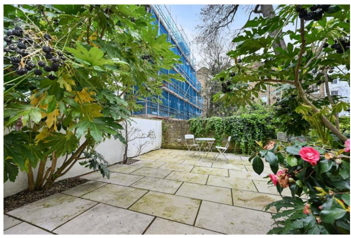
TALBOT ROAD, W2 £1,500,000 SHARE OF FREEHOLD