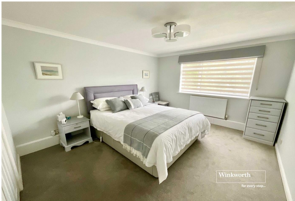
Winkworth for every step...