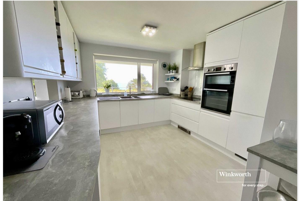
Winkworth for every step...