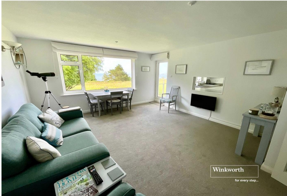
Winkworth for every step...