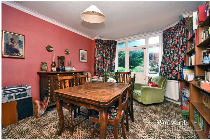
DEVON ROAD, CHEAM, SUTTON, SM2 £950,000 FREEHOLD

THE PERFECT HOME FOR FAMILIES AND COMMUTERS, LOCATED JUST OVER HALF A MILE FROM CHEAM VILLAGE, CHEAM STATION AND NONSUCH HIGH SCHOOL