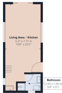
Ground Floor Building 2

Approximate total area (1) 1733.98 ft 2 161.09 m 2