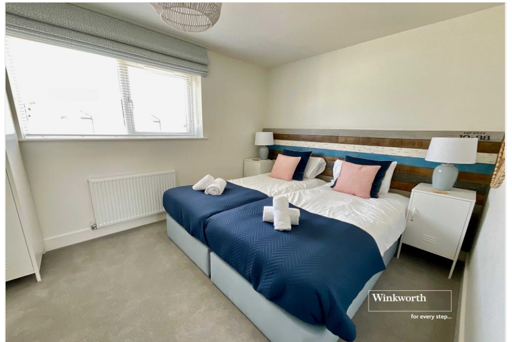
Winkworth for every step...