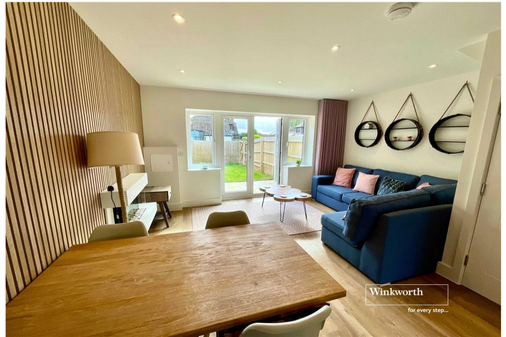
Winkworth for every step...