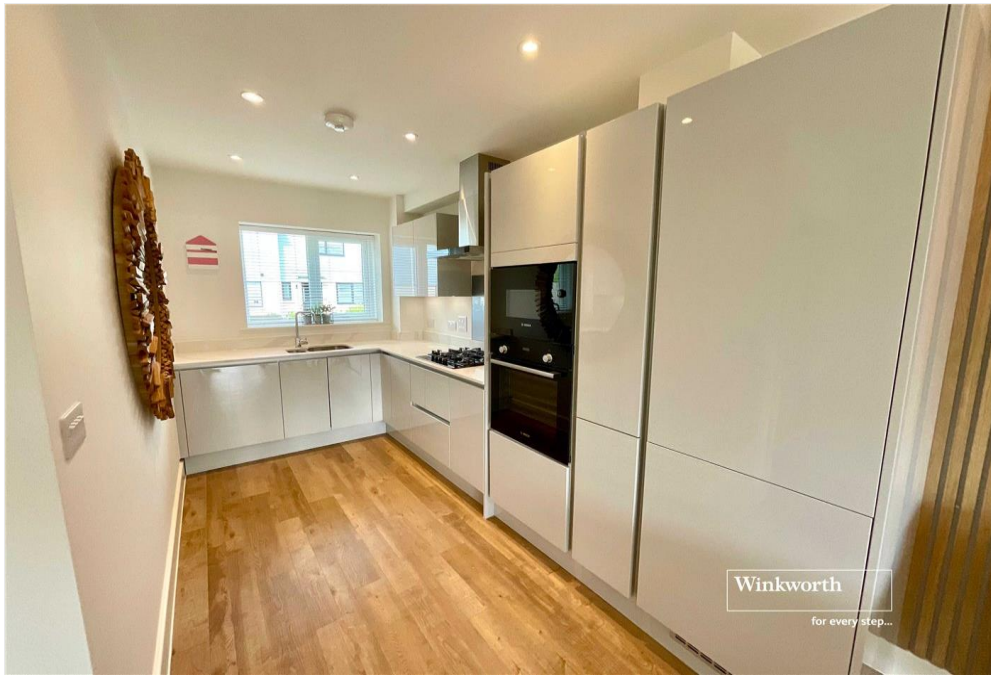
Winkworth for every step...