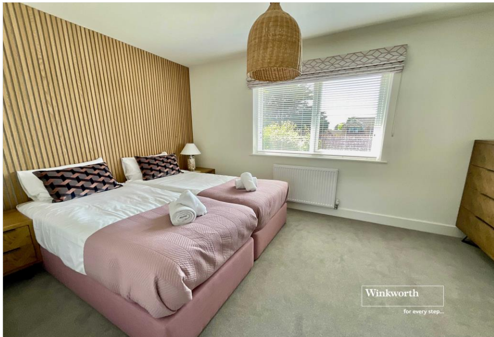
Winkworth for every step...