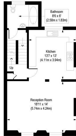
First Floor Gross Internal Floor Area 587 sq ft

COMPLIANT WITHRICS CODE OF MEASURING PRACTICE. Floorplan is for illustrative purposes only and is not to scale. Every attempt has been made to ensure the accuracy of the floorplan shown, however all measurements, fixtures, fittings and data shown are an approximate interpretation for illustrative purposes only. Liability for errors, omissions or mis-statement through negligence or otherwise is hereby excluded.