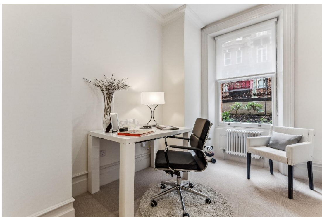
Newly Refurbished | Communal Gardens | Share of Freehold