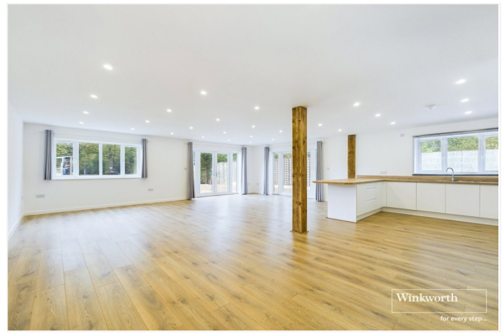
2 MILLIGANS BARN RIVERWOOD FARM, NEW MILL ROAD, FINCHAMPSTEAD, WOKINGHAM, BERKSHIRE, RG40 4QT £750,000 FREEHOLD

A RECENTLY CONVERTED THREE BEDROOM BARN CONVERSION LOCATED IN A RURAL SETTING OF FINCHAMPSTEAD WITHIN EASY REACH OF THE A329 AND CENTRAL WOKINGHAM.