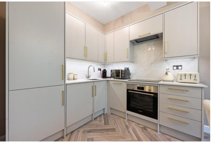
WESTBOURNE GARDENS, W2 £795,000 LEASEHOLD

A BEAUTIFULLY REFURBISHED ONE BEDROOM, SECOND FLOOR FLAT, OVERLOOKING THE COMMUNAL GARDEN SQUARE.