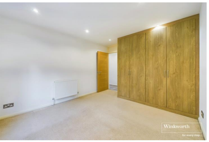
WOODBURN CLOSE, LONDON, NW4 £459,000 LEASEHOLD