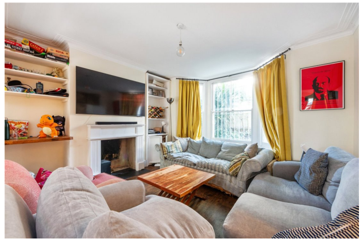
LOCKHURST STREET, LONDON, E5 £1,400,000 FREEHOLD