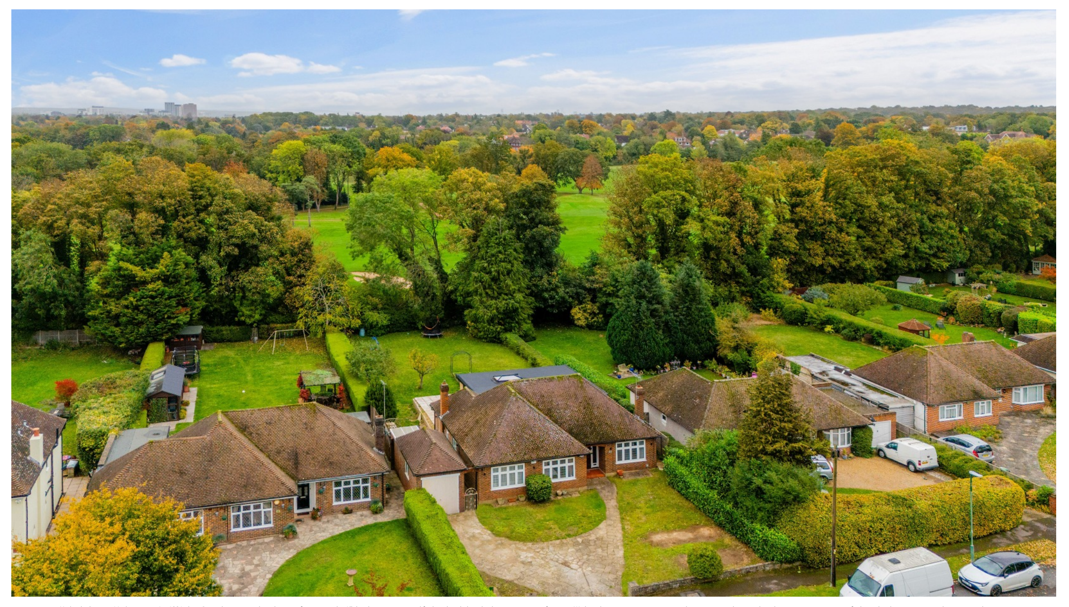
Under the Property Misdescriptions Act 1991, these Particulars are a guide and act as information only. All details are given in good faith and are believed to be correct at time of printing. Winkworth give no representation as to their accuracy and potential purchasers or tenants must satisfy themselves by inspection or otherwise as to their correctness. No employee of Winkworth has authority to make or give any representation or warranty in relation to this property.