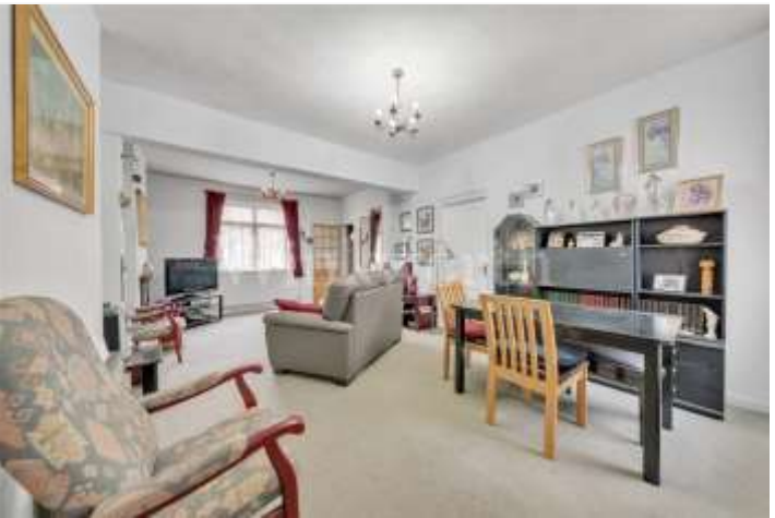
BRENT TERRACE, NW2 £500,000 FREEHOLD