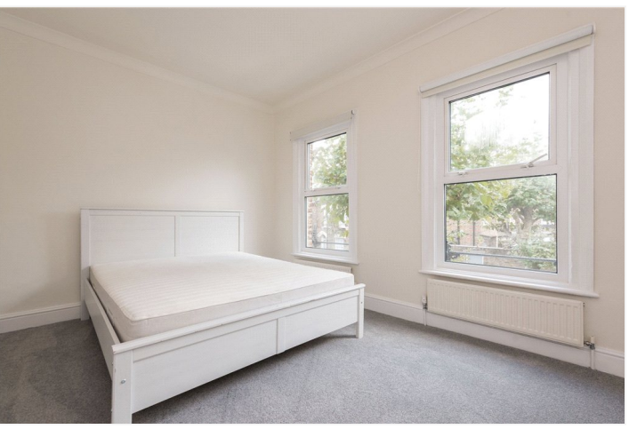
MARNE STREET, W10 £450 PER WEEK PART FURNISHED