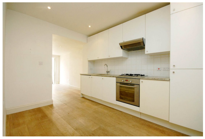
GAYFORD ROAD, LONDON, W12 £1,900 PER CALENDAR MONTH

A stylish and modern one double bedroom ground floor flat with private patio garden. Unfurnished, Available 9th December 2024