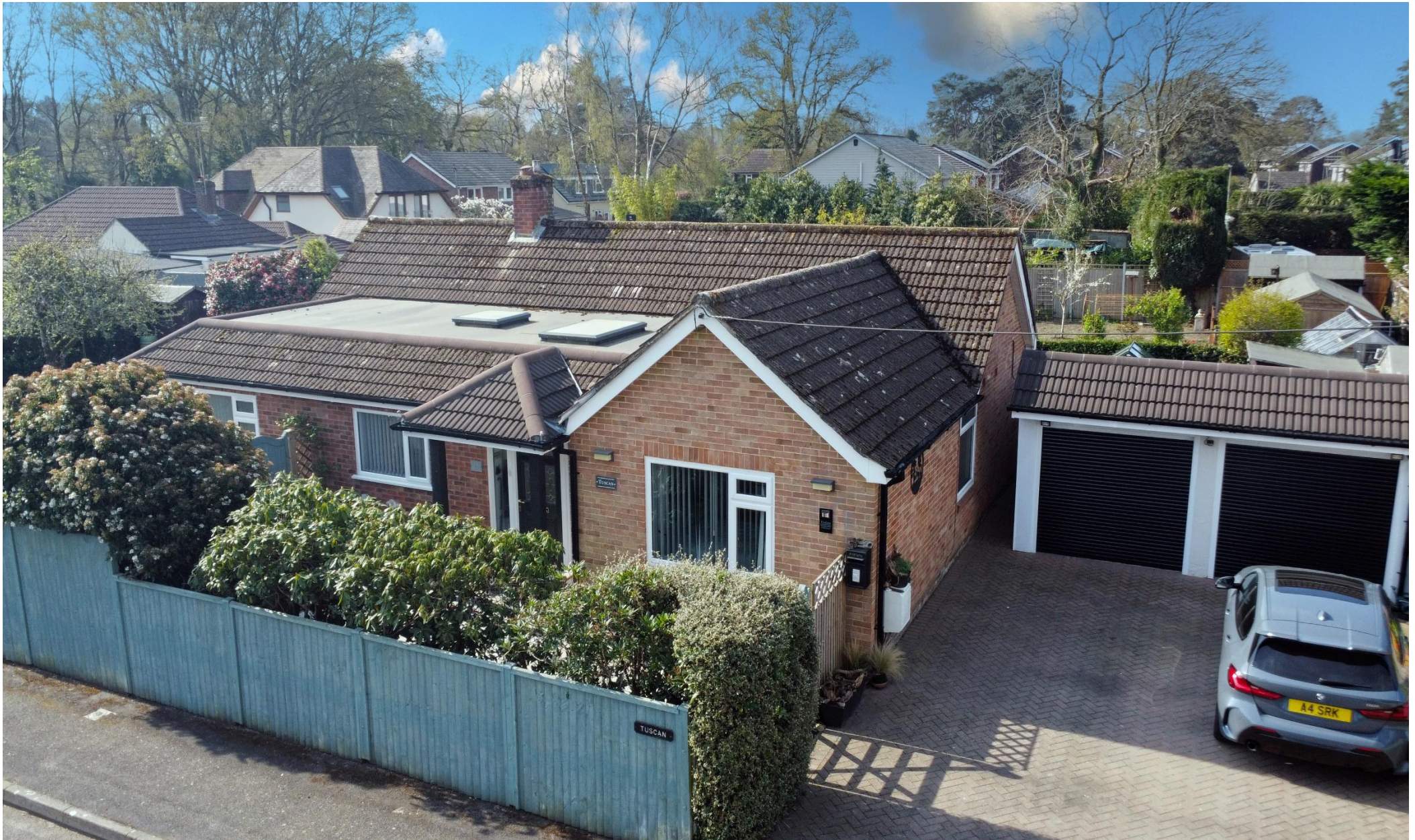
Tuscan, Hamdown Crescent, East Wellow, Romsey SO51 6BJ