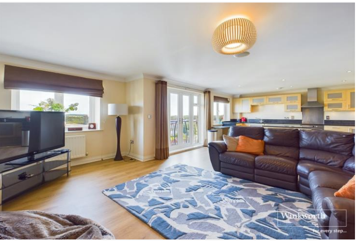
BLAKES QUAY, READING, BERKSHIRE, RG1 3EN GUIDE PRICE £450,000 LEASEHOLD