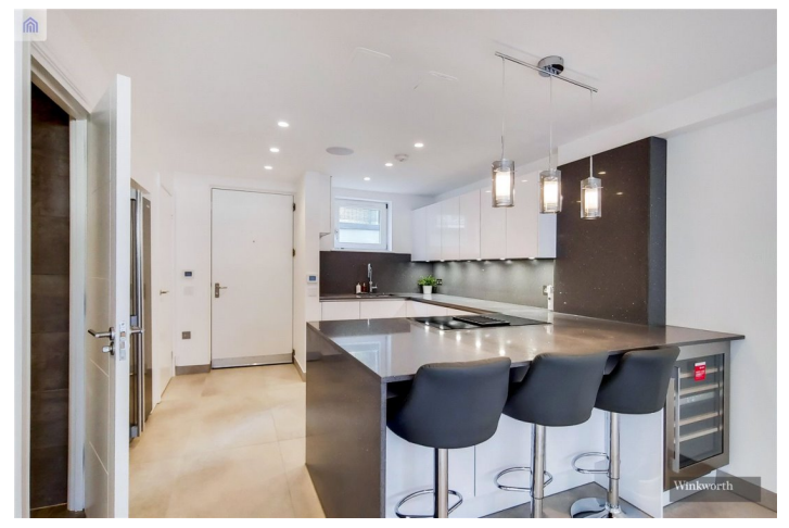
NAYLOR BUILDING EAST, ADLER STREET, LONDON, E1 £830,000 LEASEHOLD