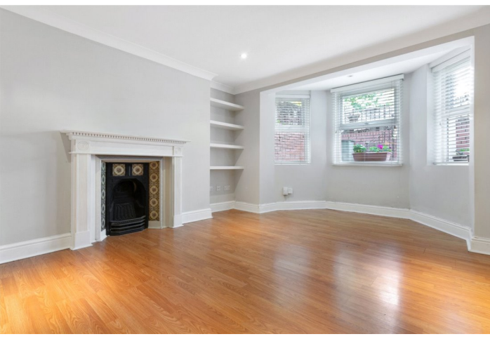
NEWICK ROAD, LONDON, E5 £350,000 LEASEHOLD