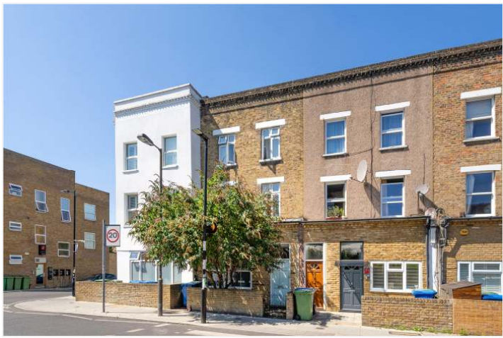
CRYSTAL PALACE ROAD, EAST DULWICH, LONDON, SE22 £600,000 LEASEHOLD