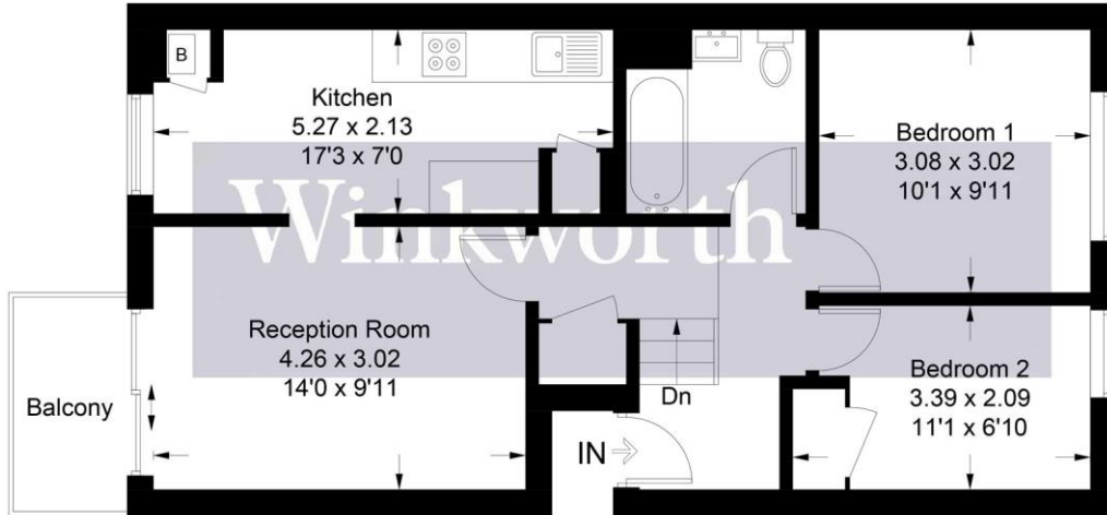
Illustration for identification purposes only, measurements are approximate, not to scale. (ID1110663)

Approximate Gross Internal Area = 55.0 sq m / 592 sq ft