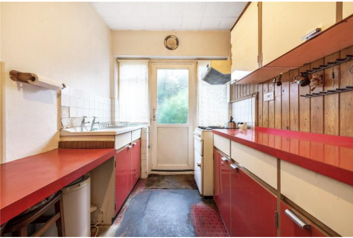
TYSON GARDENS, DEVONSHIRE ROAD, LONDON, SE23 £800,000 FREEHOLD