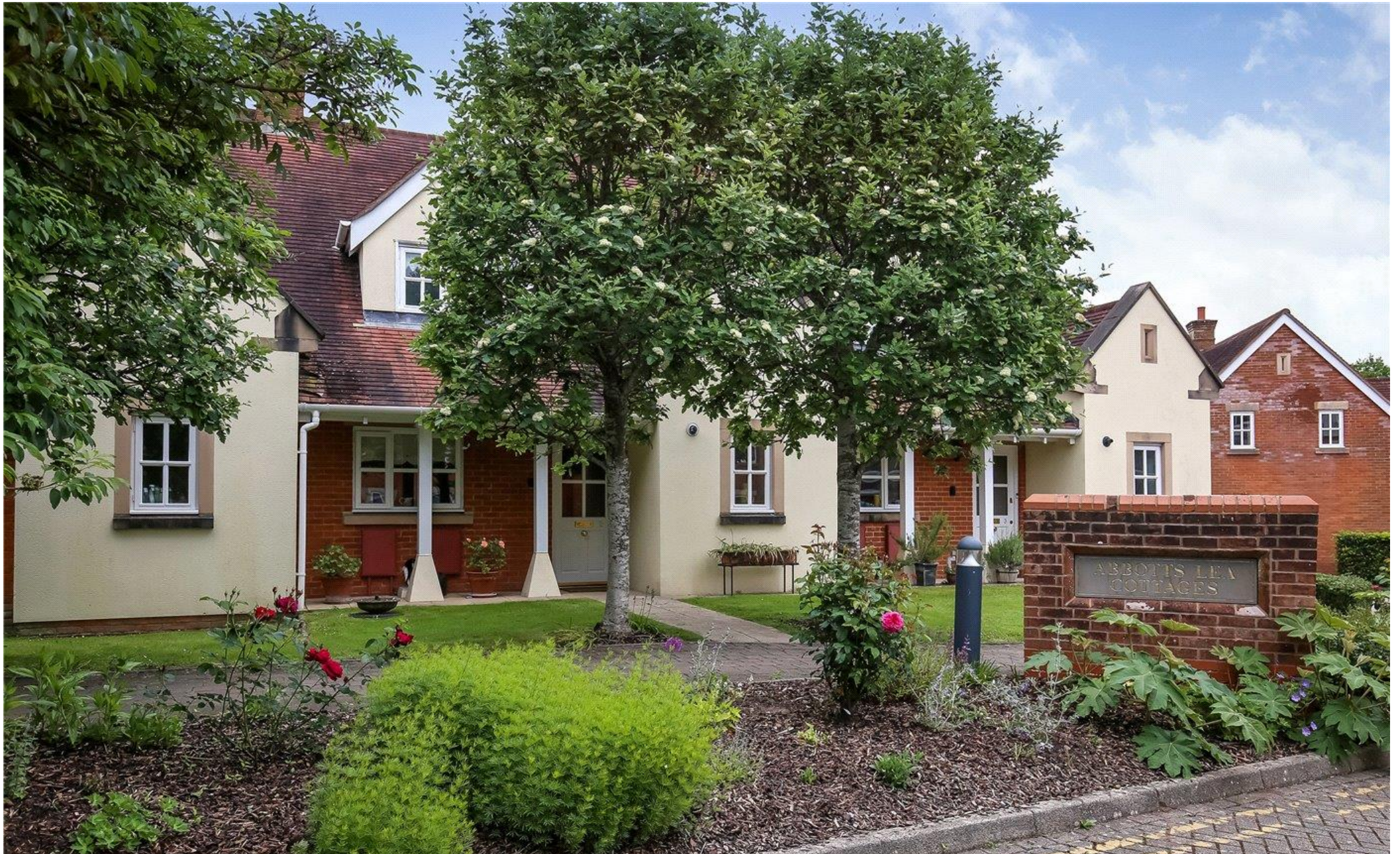
Abbotts Lea Cottages, Worthy Road, Winchester, SO23 7HB