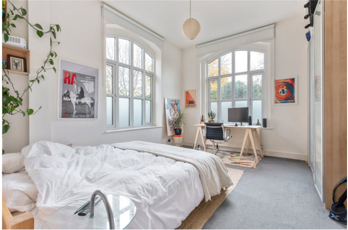
INDEPENDENT PLACE, LONDON, E8 £1,150,000 LEASEHOLD