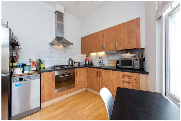
MOUNTGROVE ROAD, LONDON, N5 £450,000 SHARE OF FREEHOLD