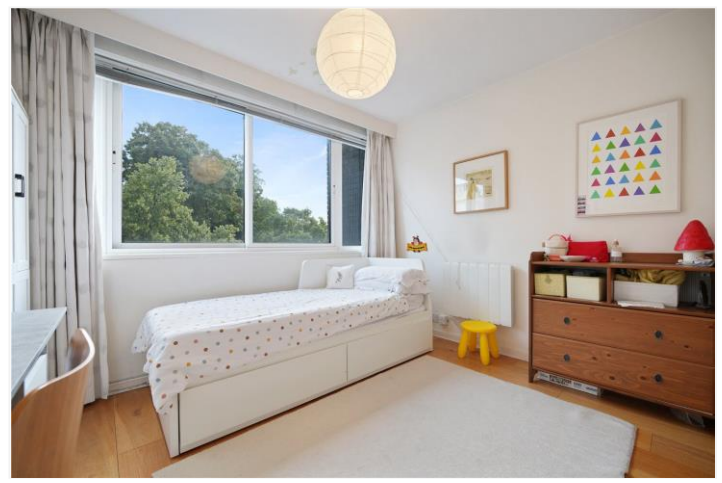
WATERFORD HOUSE, LONDON, W11 £650 PER WEEK UNFURNISHED

A VERY SPACIOUS AND BRIGHT TWO DOUBLE BEDROOM FLAT LOCATED ON THE THIRD FLOOR (WITH LIFT) OF THIS IMMACULATE MODERN BUILDING LOCATED IN THE HEART OF NOTTING HILL AND A SHORT WALK FROM THE TUBE.