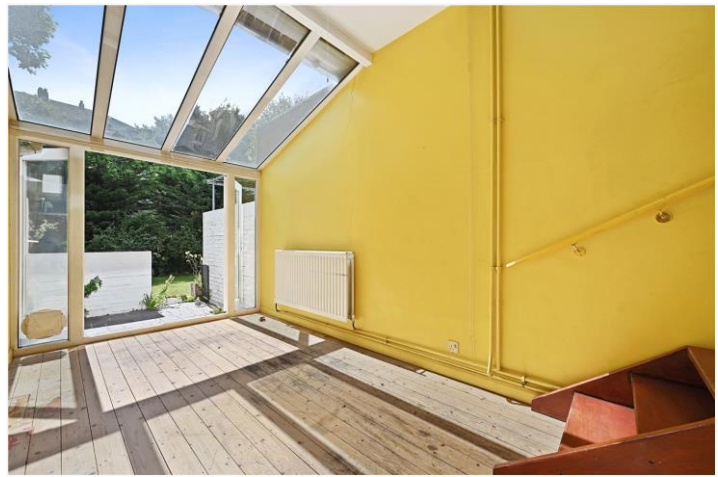
CLARENDON ROAD, W11 £1,250,000 SHARE OF FREEHOLD

AN EXTREMELY BRIGHT, THREE BEDROOM WEST FACING HOUSE, WITH PRIVATE GARDEN AND A COMMUNAL GARDEN, WITH OFF STREET PARKING IN THIS EXCLUSIVE HOLLAND PARK LOCATION.