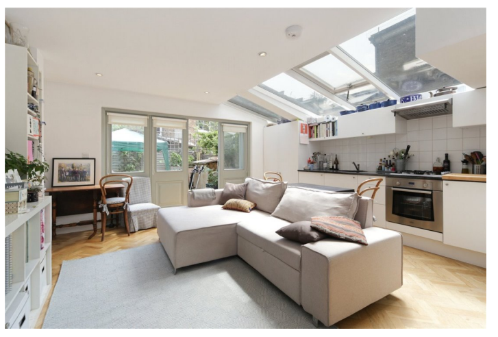
CLIFTON AVENUE, LONDON, W12 £2,350 PER MONTH UNFURNISHED £2,350 PER CALENDAR MONTH

A well-presented two double bedroom ground floor flat with private patio garden. Unfurnished, Available 11th March 2025