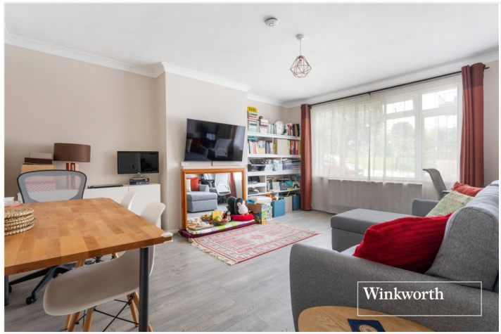
BASING WAY, FINCHLEY, LONDON, N3 £340,000 LEASEHOLD