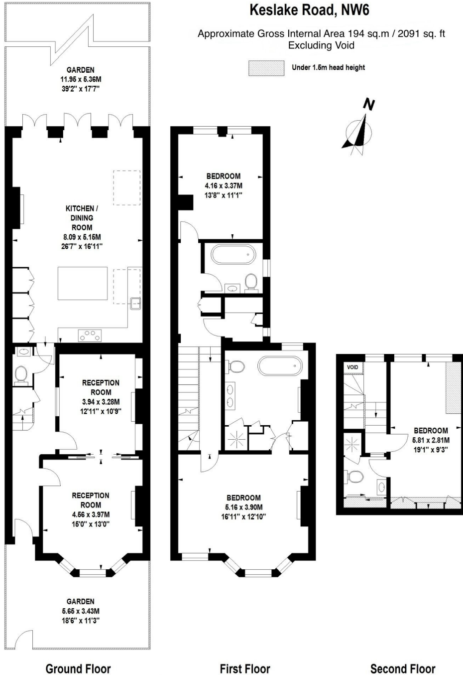
Illustration for identification purposes only, not to scale All measurements are maximum, and include wardrobes and window bays where applicable

This floorplan is for illustration purposes only and is not to scale. The position and size of doors, windows, appliances and other features are approximate.