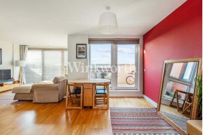
BATHURST SQUARE, LONDON, N15 £600,000 LEASEHOLD