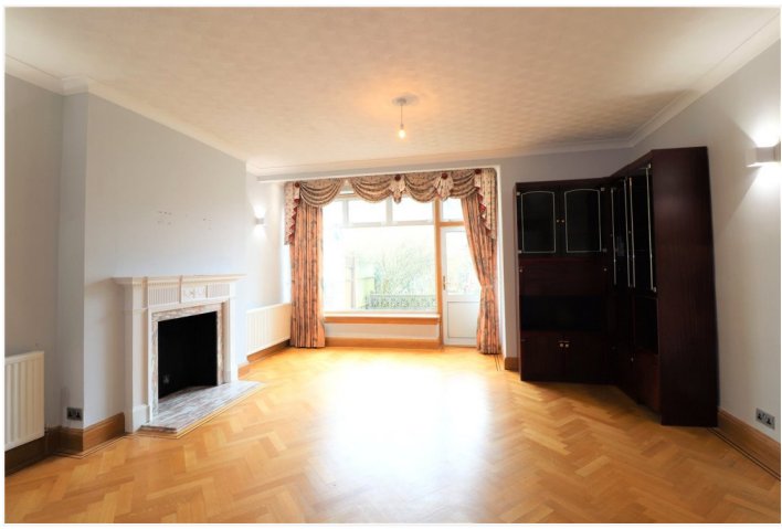
HODFORD ROAD, NW11 £1,800,000 FREEHOLD