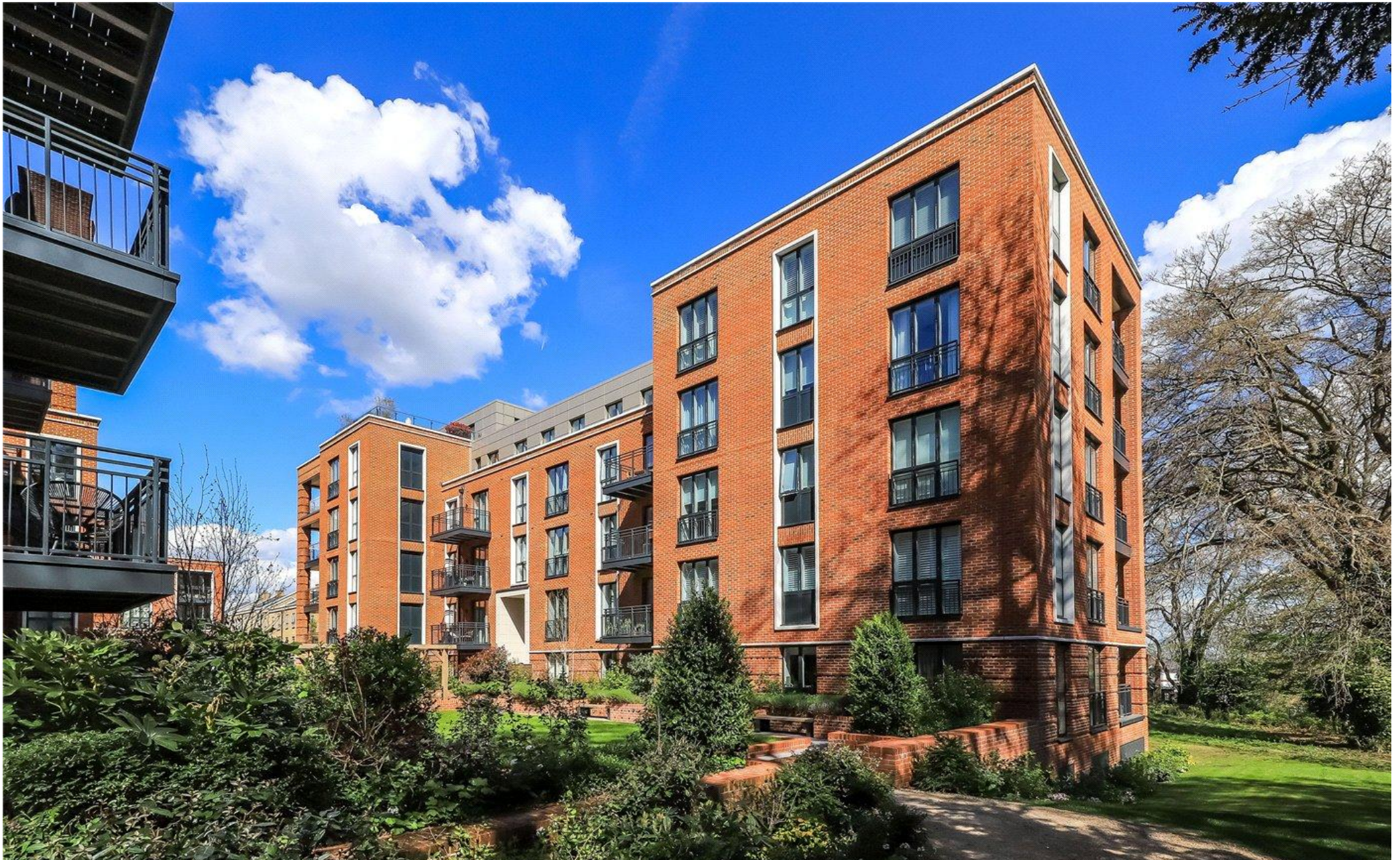
Guinevere House, Fellowes Rise, Winchester, Hampshire, SO22 5TE