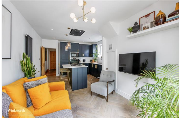
SOUTHFIELD ROAD, W4 £600,000 SHARE OF FREEHOLD