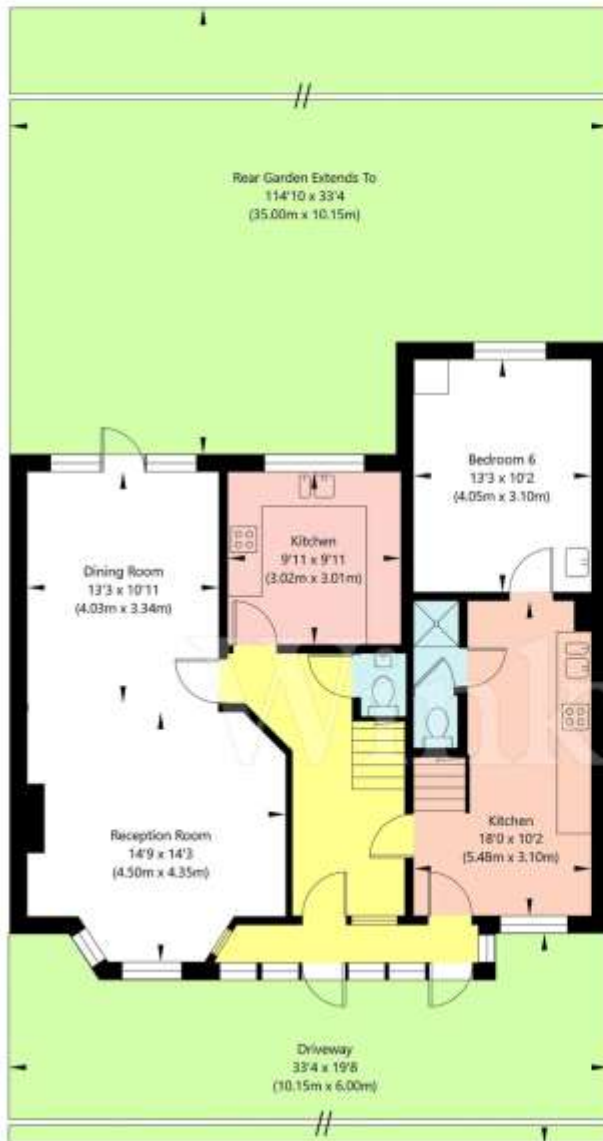
Ground Floor GROSS INTERNAL FLOOR AREA APPROX. 87.46 SQ M / 941 SQ FT