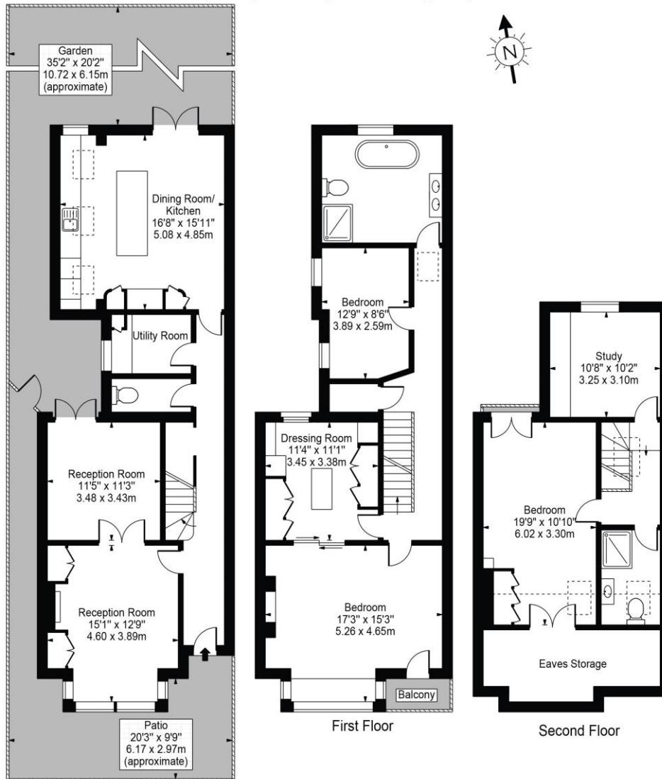
Ground Floor For Illustration Purposes Only - Not To Scale Floor Plan by Mira Nikolova Photography

Approx. Total Internal Area 2152 Sq Ft - 199.93 Sq M (Including Eaves Storage & Restricted Height Area) Approx. Gross Internal Area 1988 Sq Ft - 184.69 Sq M (Excluding Eaves Storage & Restricted Height Area)