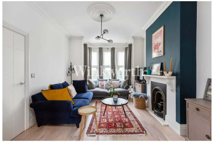
WALDEGRAVE ROAD, N8 £795,000 FREEHOLD