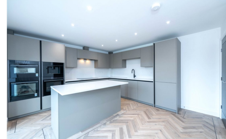
10 Butters Corner, Metheringham, Lincoln, Lincolnshire, LN4 3GE