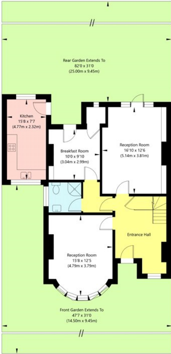
Ground Floor GROSS INTERNAL FLOOR AREA APPROX. 79.3 SQ M / 854 SQ FT